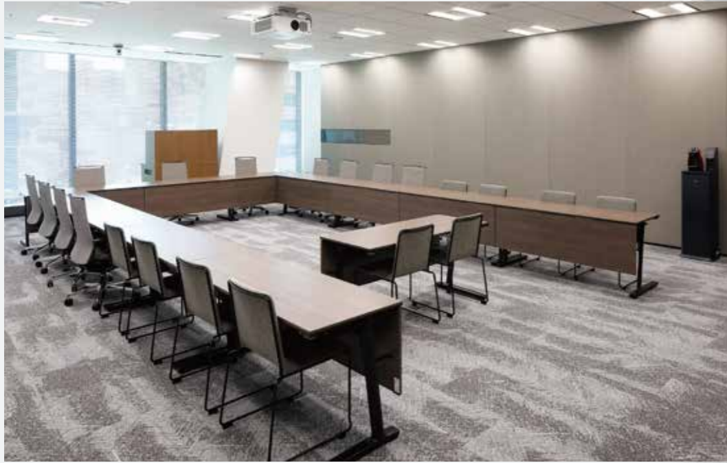
Hearing Room (Main Room)