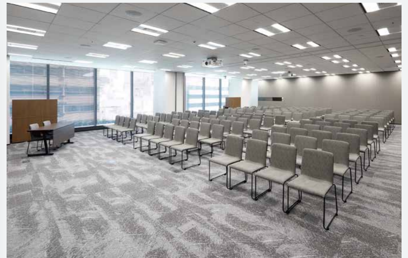
Hearing Room (Main Room)(for Seminar)