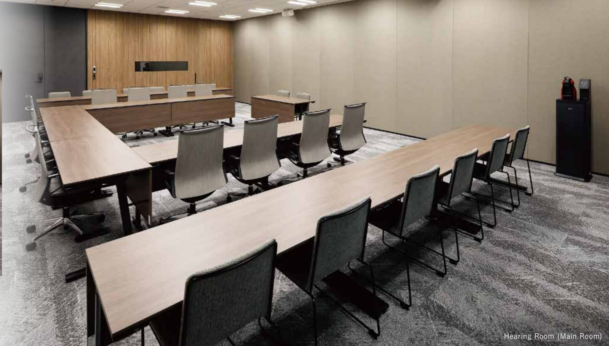
Hearing Room (Main Room)