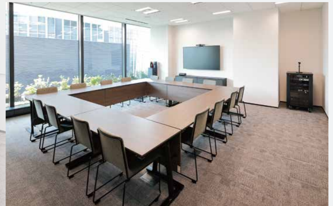
Breakout Room (Medium Room)