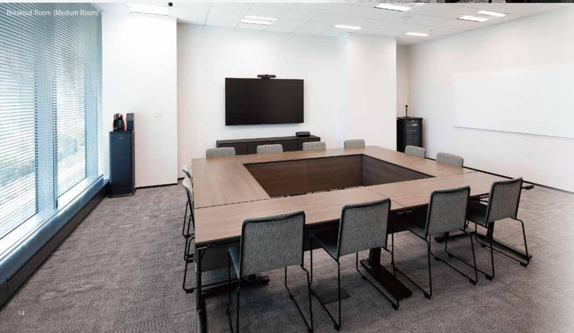
Breakout Room (Medium Room)