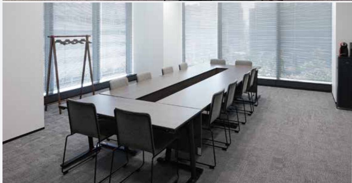
Breakout Room (Small Room)